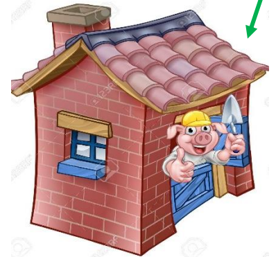
third pig 3